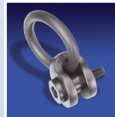
Side Pull (Traditional)™