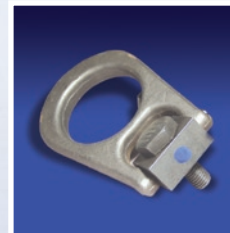
Forged Center Pull™