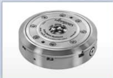
Flange Type Modules