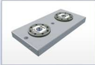
Clamping Plates w/Built-In Modules