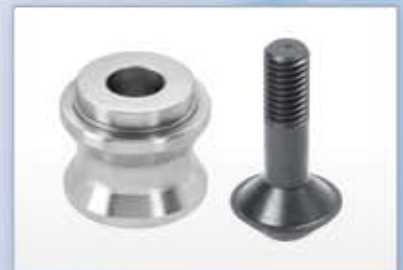
Pull Studs and Engagement Screws

Contact Jergens today to learn just how short the payback period is for the Jergens Zero Point System! www.jergensinc.com/zps